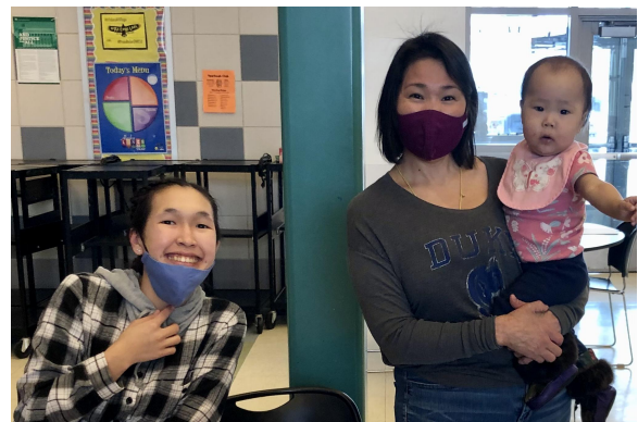
All activities were adapted to allow even the youngest participant to join.

The biggest hit of the night was Literacy Bingo. Valentine’s Day themed sight words were used to create Bingo boards. Every time a new word was read outloud, participants would spell the word along with the caller. Winners received first choice of books from the prize table. Before cleaning up, drawings were held for prizes like stuffed bears, heart candies, and Valentine’s Day cards.